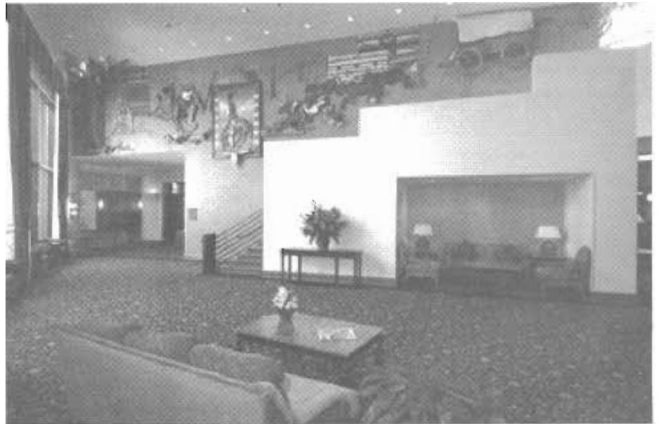
The lobby of the NABS convention hotel, the Airport Hilton in San Antonio, Texas