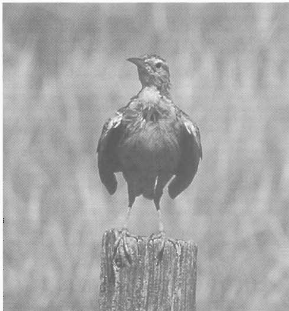
This juvenile Western Meadowlark was trying to beat the heat in South Dakota one July afternoon by standing high and spreading its wings. Both actions were meant to cool the bird by increasing the body surface exposed to air.