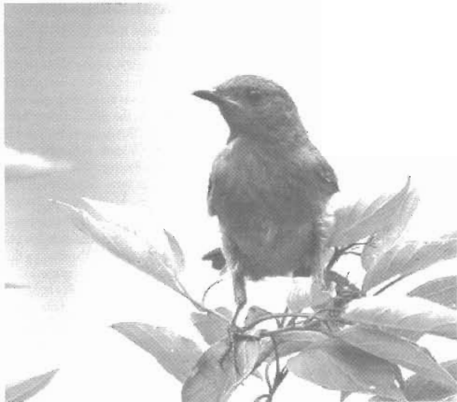
A juvenile Eastern Bluebird: Enjoy bluebirds and other species on the Sam's disc set.

If you prefer to order on-line using PayPal, visit www.nabluebirdsociety.org/2005gift . Please order by Dec. 9 to ensure Christmas delivery. Payment must be in U.S. funds.