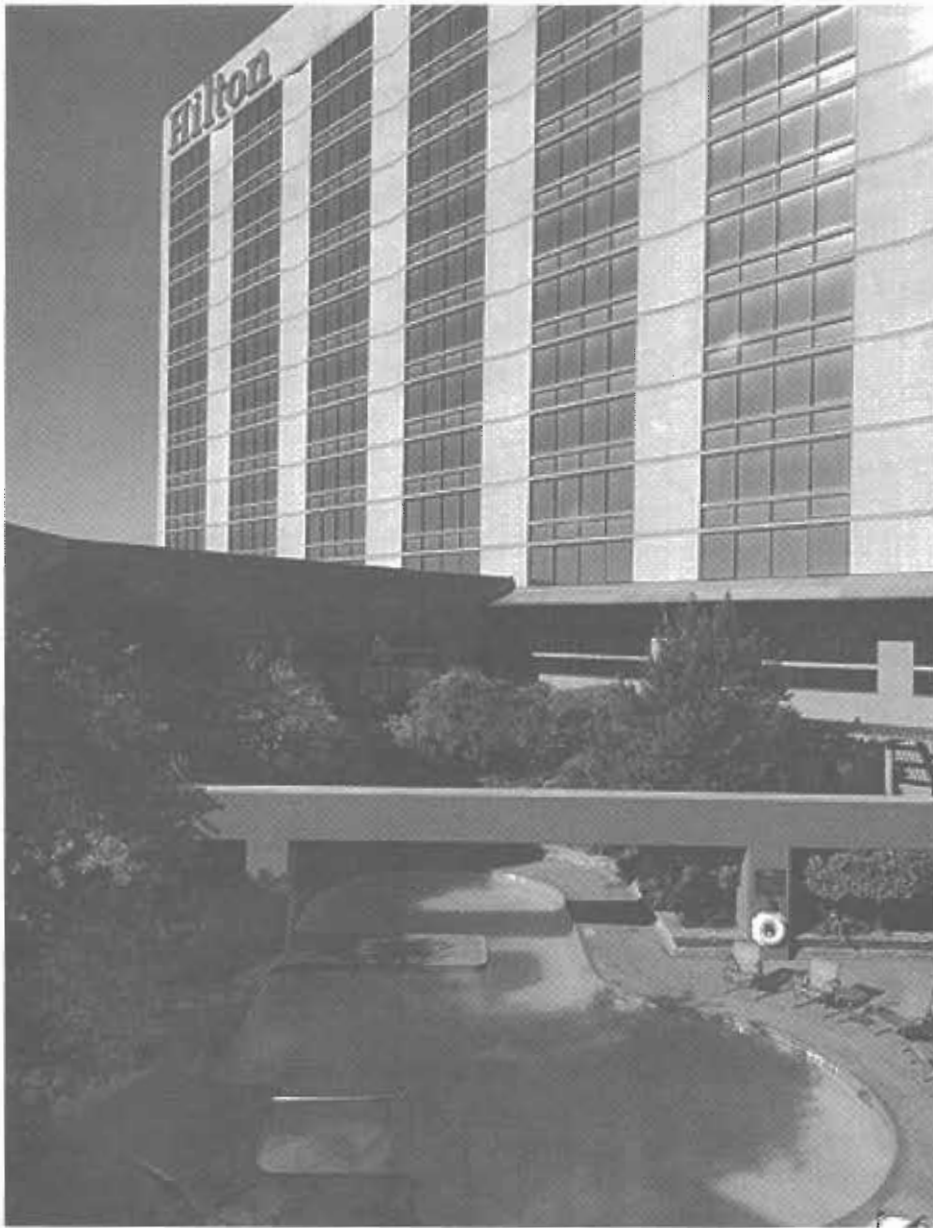
The Airport Hilton in San Antonio, overlooking the outdoor swimming pool.