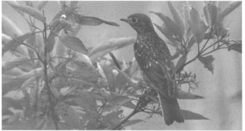
Fruit is an important part of fledglings' diet. This young Eastern Bluebird is seeking its own food.

Larvae of butterflies and moths were the most common food of both nestlings and fledglings, comprising about one-third of the diet. Grasshoppers also were common, especially in summer. Spiders were