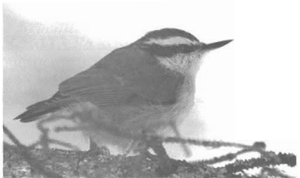
Red-breasted Nuthatch